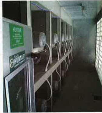
A fan-wall system creates uniform velocity in the ductwork and minimizes vibration and noise.

"Hospitals are complicated, and there was an opera-