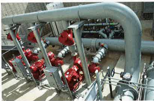
Condenser-water pumps serve the mission-critical needs of Mills-Peninsula Medical Center.

Hospitals can be notoriously challenging for HVAC design engineers. The mission-critical nature of the work, the need to provide tight temperature and humidity control in specific areas and visitor comfort in others, strict ventilation requirements to prevent the spread of airborne infection, and the need for it all to run as efficiently as possible all conspire to make the design engineer's job a tough one. Add in the presence of an active fault less than two miles away and the need to design a building that will withstand a magnitude 8.0 earthquake, and you've got an idea of what Ted Jacob Engineering Group Inc. (TJEG) faced when long-time customer Sutter Health called for help.