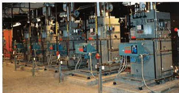
High-pressure steam boilers in the central utility plant.