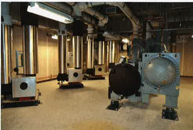
The chilled-water plant at Mills-Peninsula Medical Center.

Fan-wall systems create uniform airflow in the duct-