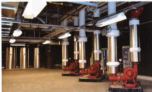
Secondary heating hot-water pumps help provide outstanding system control.

system with run-around heat recovery and VAV not only offered energy savings, but had the lowest life-cycle cost.