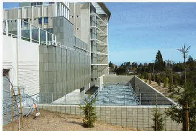
Cooling towers in the service yard. Note their proximity to a nearby residential area.

work and minimize vibration and noise. Multiple fans increase system redundancy and reliability. Fan-wall installations reduce length of the AHU cabinet because of shorter downstream airflow requirements. Also, they eliminate the need for sound attenuators, thus further reducing overall AHU length and required fan horsepower.