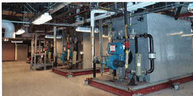
Heating hot-water boilers located in the central utility plant can utilize either natural gas or fuel oil.